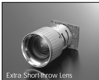
Extra Short-throw Lens

The extra-short throw lens makes it possible to produce a large display in the smallest of rooms. Experience a large screen without the need of a huge space. This projector has a footprint the size of a letter pad, but can still produce a large widescreen picture. Compare that to the space taken by a traditional-technology large-screen television—and can that generate an 80" 16:9 diagonal image within just 2.5 metres?