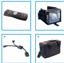
For optional* accessories please contact your dealer.